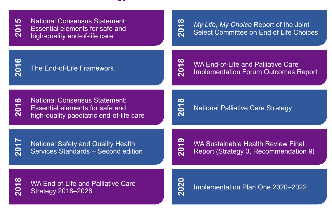
Figure 2 Strategic alignment of the WA End-of-Life and Palliative Care Strategy 2018–2028 and IP1

'A dignified end of life will become part of community conversations, with greater planning and support for people to have more choices and access to appropriate end-of-life care'